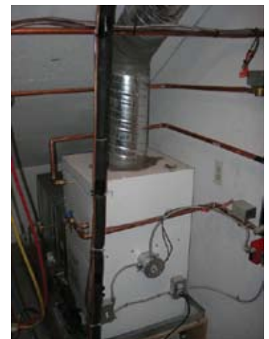
Located in corner, out of the way saving space in the building

A total of seven tons of cooling is conditioning this building. In this application two Hi-Velocity units installed in the vertical position (up-flow) were used, a HV-70 and a HV-100. They were easily placed in out of the way places, as the Hi-velocity System does not need to be centrally located.